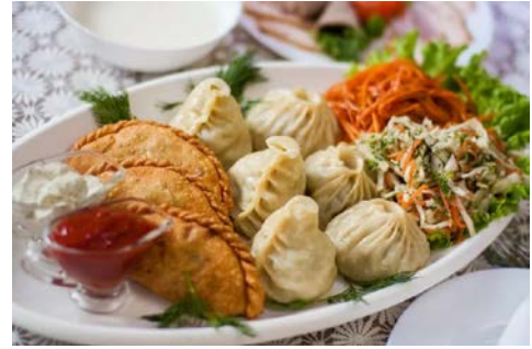
Day 10 Mongolia. Our Trans-Siberian adventure takes us into Mongolia, home of Genghis Khan, undoubtedly the most feared and revered Mongol and we visit the capital city of Ulaan Baatar. Lunch is taken Mongol style in a traditional Ger (Yurt) where we experience an authentic meal,