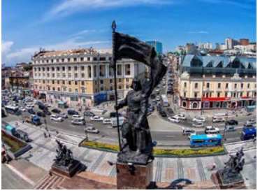
Day 15 Following breakfast, you will be transferred to Vladivostok airport to begin your journey home.