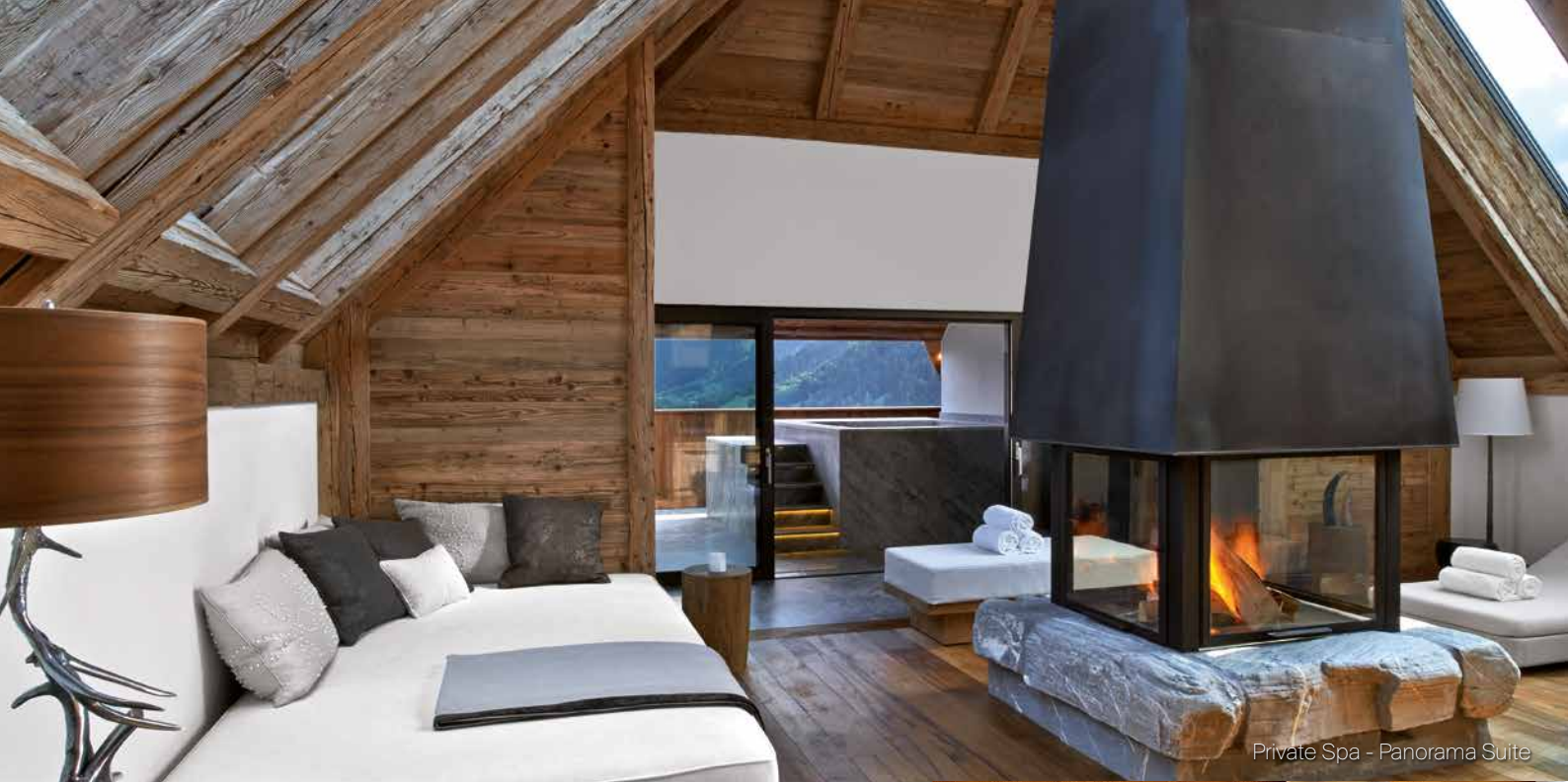
Private Spa - Panorama Suite